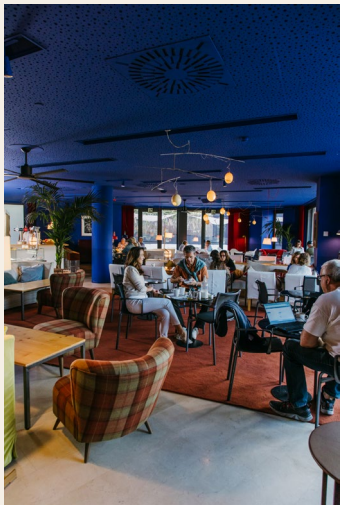
El Sant Cugat Hotel

And much more! Tell us what you'd like, and we will make it happen.